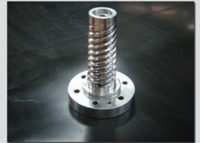
Optimized die design ensures uniform flow distribution.